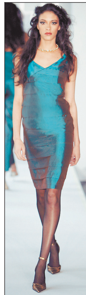
MULTI BY BREE PHOTOS

◀ On Feb. 11, the New York Post featured this Multi by Bree gown on Page 3 as part of its Fashion Week coverage.